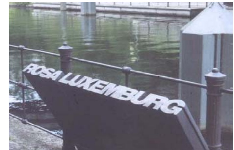
Memorial at the site of Rosa Luxemburg's murder in Tiergarten.